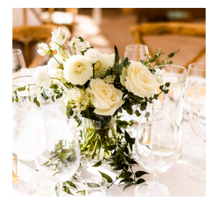
*glass cylinder vase only